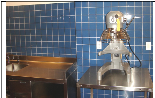
Hazard: Outlets are not protected with Ground Fault Circuit Interrupters, which are required in kitchens due to wet floors by 1999 NFPA 70E Section 110-10. Solution: Install low cost GFCI outlets in the kitchen and near all water sources.