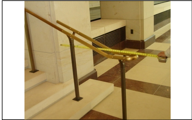
Solution: Turn handrail end into the wall.