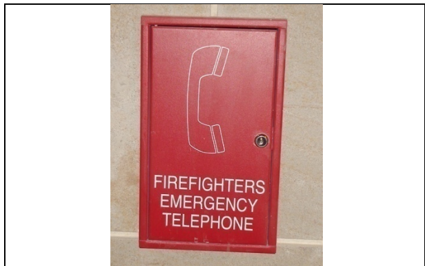
Hazard: Telephones at staging areas are locked, prohibiting use. Solution: Change lock on cover into a knob or handle that is compliant with 28 CFR Part 36 Appendix A Section 4.27.4.