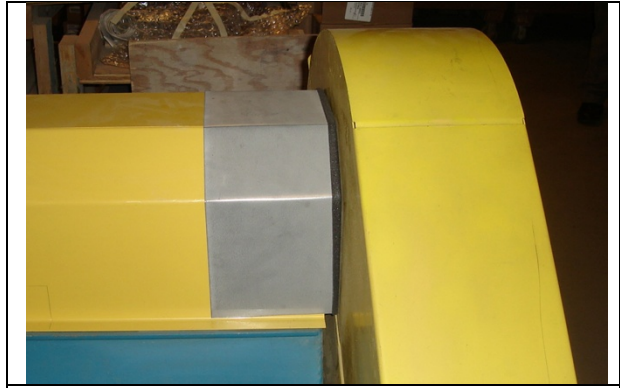
Solution: Modified guard protects operator and employees and is low cost.