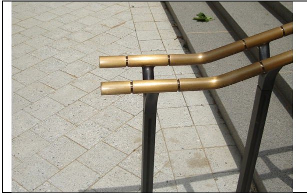
Hazard: Protruding handrails create projection hazard not compliant with 29 CFR § 1910.23(e)(5)(i), 2000 NFPA 101 7.2.2.4.5, ANSI/ASSE A1264.1-2007 Section 5.8 and ASTM E 985-00 Section 4.3.2.