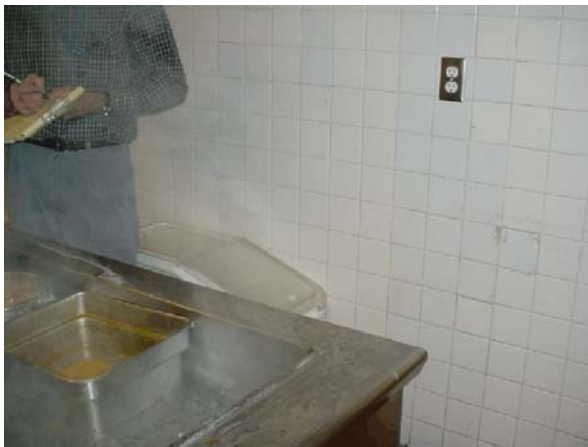
Figure 2 Kitchen outlet not meeting NEC GFCI protective requirements

circuit when the fault current exceeds a range of about 4 mA to 6 mA, as seen in Figure 1. In recent years, the Occupational Safety and Health Administration (OSHA) and the National Electrical Code have expanded the applications requiring GFCIs.