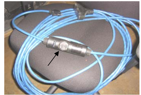
Figure 5: GFCI built directly into an extension cord for temporary service