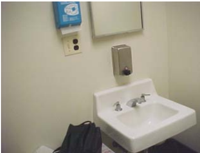
Figure 3: Bathroom receptacle not meeting OSHA and NEC GFCI protection

A GFCI is not the sole safety device required on each circuit. There is also a requirement for overcurrent protection that is typically accomplished by using a circuit breaker in the panelboard. All circuits must have an effective grounding system with low impedance on the ground wire back to the panelboard.