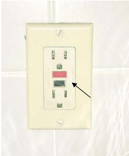
Figure 1 Outlet with GFCI protection