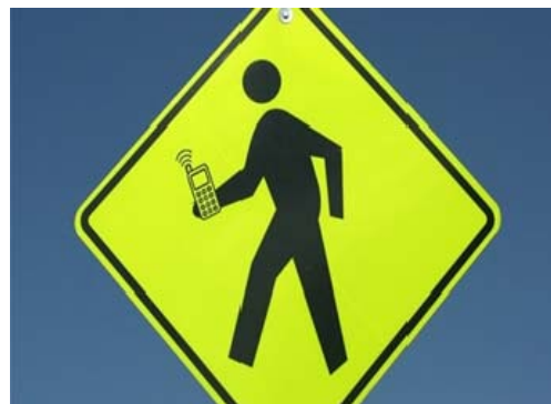
Sign: Caution pedestrian texting