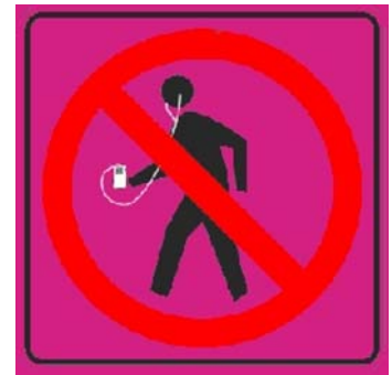
Sign: No Pedestrian Crossing with MP3 player

Fewer laws ban texting while walking. Several states have attempted to restrict the use of electronic devices while walking and met with public outcry. Each of the proposed bills has quietly died before becoming law. Illinois was the first state during the 2007-2008 session to consider a ban on using a cell phone while crossing a street. Violation of this law was a petty offense and only carried a fine of $25.00. In 2007, a New York State Senator proposed a bill to make it illegal to listen to any kind of portable electronic device, music or video player, cell phone, smart phone, gaming device, etc., while crossing the street in cities such as New York, Albany, and Buffalo. Joggers and bicyclists would have to limit the use of these items to city parks in which no street crossing would be involved. Florida and Wisconsin have proposed similar laws. To date (April 2010), not one piece of legislation has been passed into law.