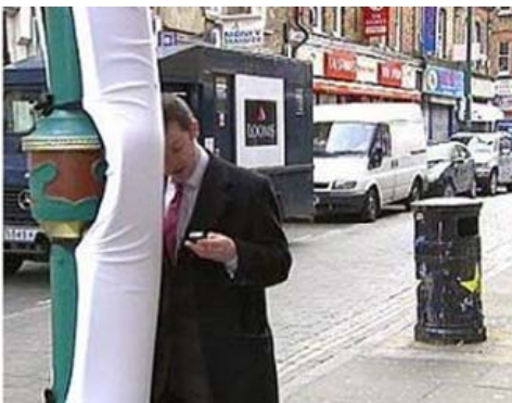
Britain's 'safe text' street features padded lamppost

Studies done in several other countries have shown that distracted walking is a hazard that is not unique to the United States. Research conducted in both Japan and England show similar increases in this trend. An experiment was conducted in London's busy Brick Lane area which was identified as the top spot for London's 68,000 texting accidents in 2007. Lampposts and other obstructions were wrapped and padded to minimize injury to pedestrians who texted and talked on cell phones as they walked. Cameras were installed to capture pictures of people running into these obstructions and record incident frequency. The idea could be rolled out to other London texting hotspots if this trial is successful.