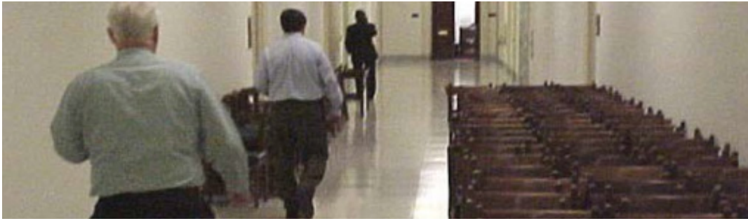
Figure 4: Even temporary storage is considered a potential hazard