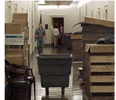
Figure 2: Storage completely blocking a corridor

The Office of Compliance encourages all offices to make sure all exit routes are kept clear so potential evacuations can be as safe and swift as possible. Keep in mind when temporarily relocating furniture that entire exit access routes must be a minimum of 36 inches for wheelchair users, and greater clearances for employees and visitors in areas that will have large numbers exiting in the event of an emergency. This 36 inch width cannot decrease anywhere along the exit route.