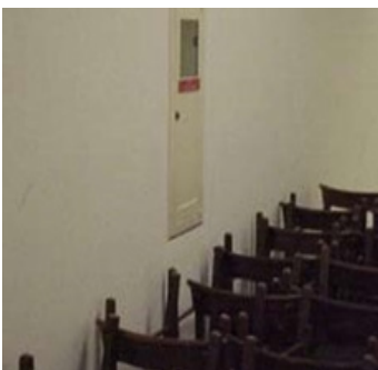
Figure 1: Pull station and Fire Extinguisher blocked by stored furniture in corridor

When items are stored in corridors, they often will be placed along the wall; however, important safety devices such as fire extinguishers, automated external defibrillator (AED) wall mounted units, some escape masks, and fire alarm pull stations, are often mounted on walls. Access to safety devices must not be obstructed by improperly stored or placed items. Important signs that show exits and evacuation routes, as well as Braille exit and staging area signage, must also be clear of improperly stored items. Blocking such signage may prevent individuals with disabilities from safely evacuating the building. Similarly, persons who use a wheelchair may be hindered by storage in the hallways.