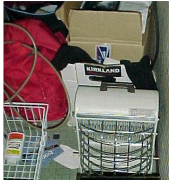
Figure 1: Space heater surrounded by combustible materials

Although space heaters appear to be harmless to some, many hazards can still exist no matter where they are used. In 2005-2009, space heaters caused 32% of home heating fires or structural fires and resulted in thousands of injuries as well as civilian deaths. (See "Fast Stats" on Page 3) The most serious hazards associated with space heaters are fire hazards. The majority of space heater fires are caused when combustibles (e.g. paper, clothing, and curtains) are placed too close or come in contact with the heater causing them to catch fire. Portable electric space heaters have a higher risk of fire than fixed electric heating devices.