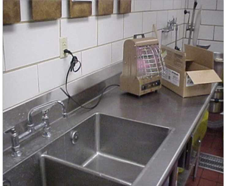
Figure 3: Space heaters should not be used near a sink, as seen above, or near combustible materials