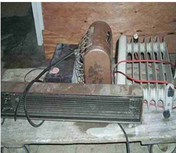
Figure 2: An example of space heaters not approved by a NRTL