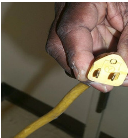
Appliance plug missing ground prong

✓Ensure that office annunciators are working properly and kept fully charged for emergency use. Reset them after each use.