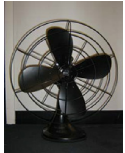
Poorly guarded fan

✓ Make sure that when file cabinet drawers are in use that they do not block a walkway and are not left unattended. Close drawers completely after use. Make sure when loading file cabinets that heavy items are placed on the bottom to keep the cabinet stable when in use.